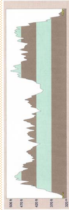
Elevation Profile Based on a 16 mi. loop

www.boomersrockyhill.com boomersbicycles@hotmail.com